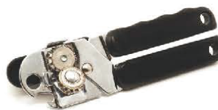
Manual Can Opener