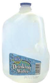
Water Supply for 72 Hours