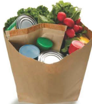
Food Supply for 72 Hours