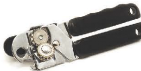
Manual Can Opener