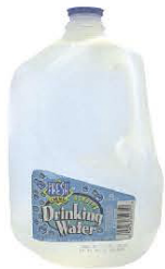
Water Supply for 72 Hours