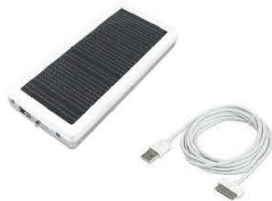
Cell Phone, Chargers & Solar Charger