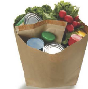
Food Supply for 72 Hours