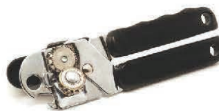
Manual Can Opener