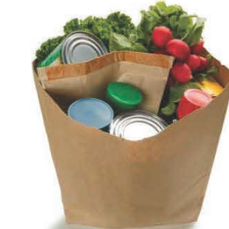
Food Supply for 72 Hours