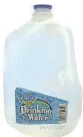
Water Supply for 72 Hours